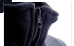
Detalle del cuello